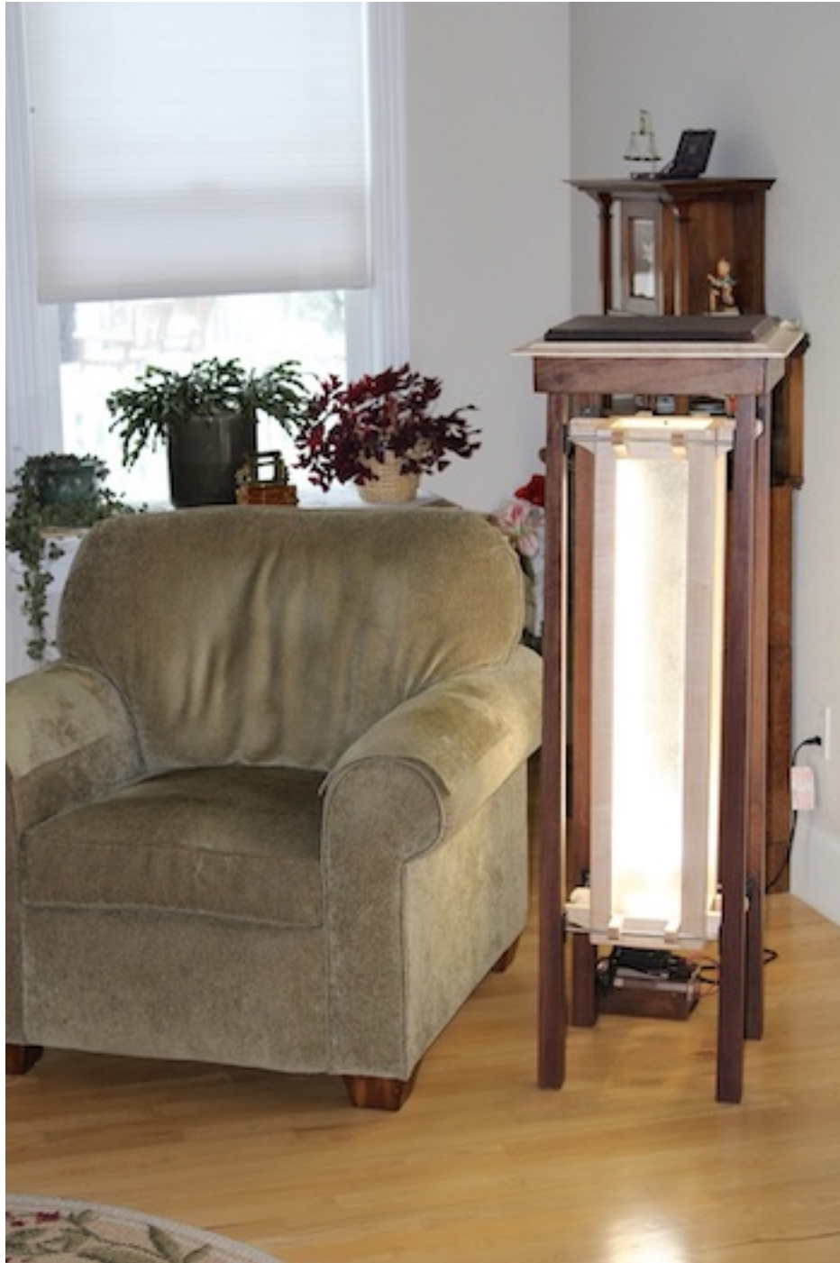
Walnut and maple floor lamp